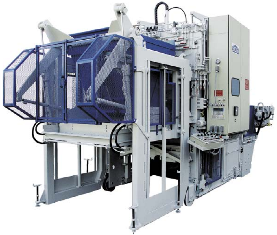
940 Super 100: Unlimited production possibilities.

Even high products up to 1.000 mm used for landscaping design can be ideally manufactured with this machine in volume matching highest quality aspects. Segmental units such as pavers with face mix or multi cavity blocks as well as insulating blocks incorporating the famous multilayer idea created by ZENITH or curbstones with or without face mix are ideal products for this machine. Even palisades of different heights are no problem. The shortcut to a ready cube.