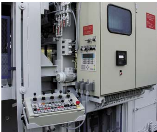
control panel / control cabinet

The well known ZENITH quality and safety features stand for low maintenance and uninterrupted production process. Optimized quality control and simple control systems guarantee easy performance at top level. What would you like to produce today?